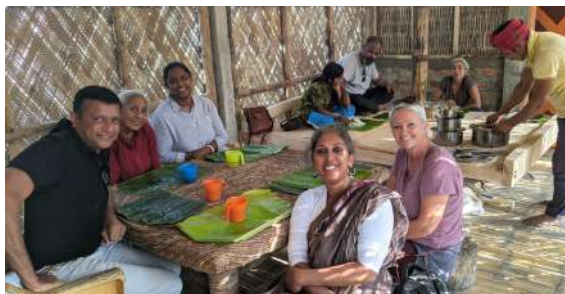
Small Group Curation & Interactions