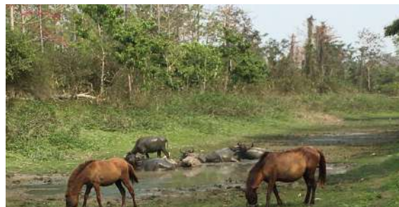
Explore Faded Histories & Sites