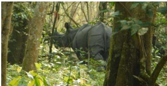
Wildlife Safaris & Forest Walks