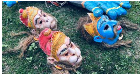
Local Artisans & Demonstrations