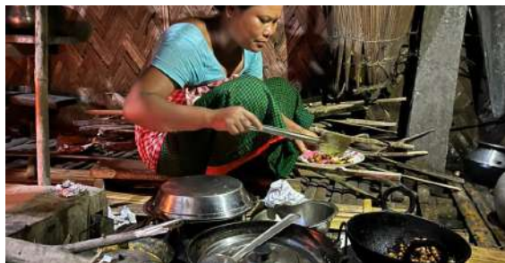
Savour Cuisines and Traditions